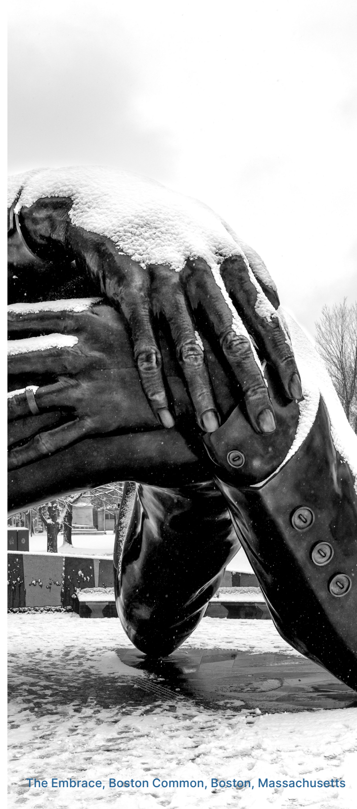
The Embrace, Boston Common, Boston, Massachusetts

Given the outlook, a well-diversified portfolio that aligns investor goals with timelines and risk tolerance remains the best path forward for most investors. If concerns remain, you should speak with your financial advisor to go over your financial plans and goals.