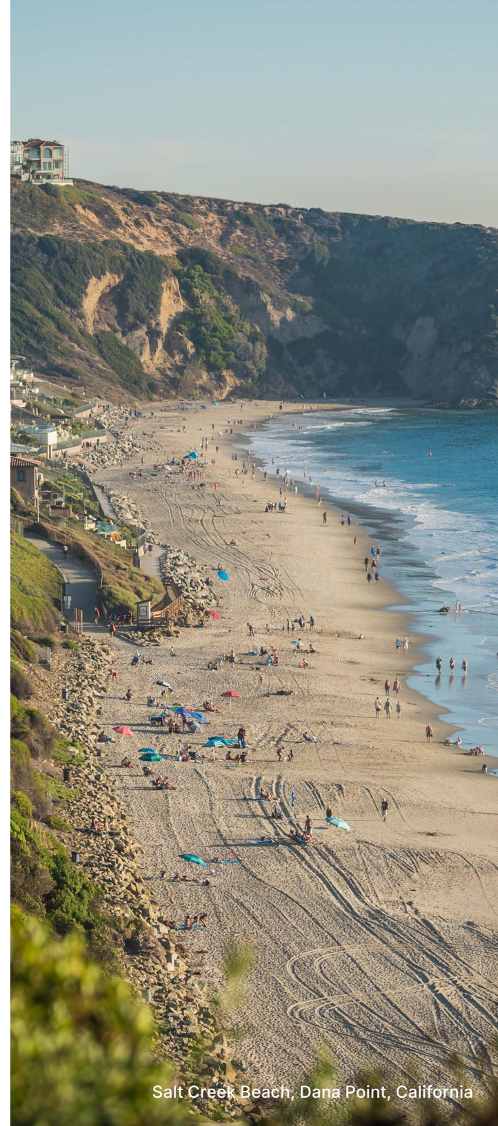
Salt Creek Beach, Dana Point, California

While March served as a reminder that risks can shift suddenly for markets, the long-term outlook remains solid due to the healthy fundamentals. Given the potential for further short-term disruptions, a well-diversified portfolio that matches investor goals and risk tolerance remains the best path forward for most. If concerns remain, you should speak with your financial advisor to go over your financial plans.